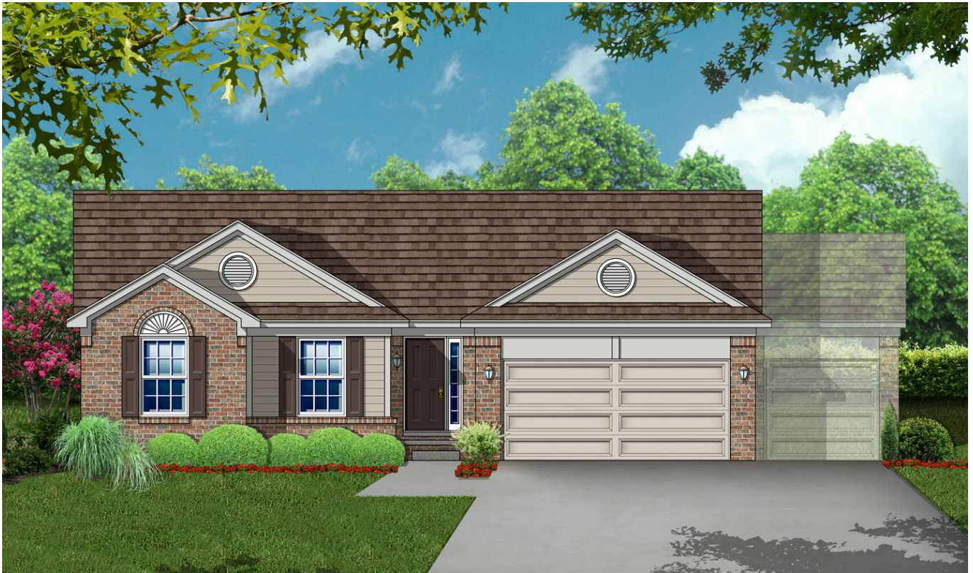
Shown with optional 3-car garage ghosted.