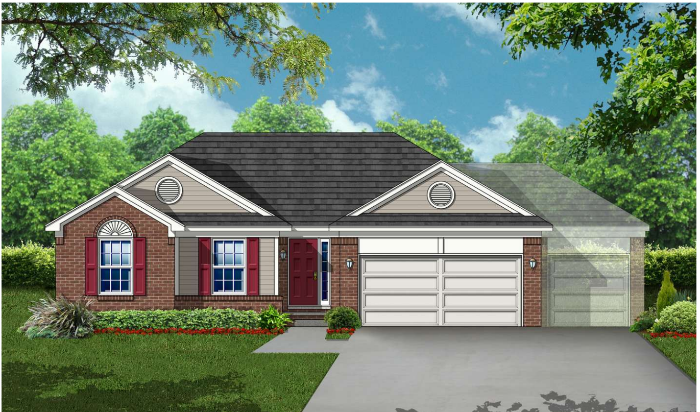
Shown with optional 3-car garage ghosted.